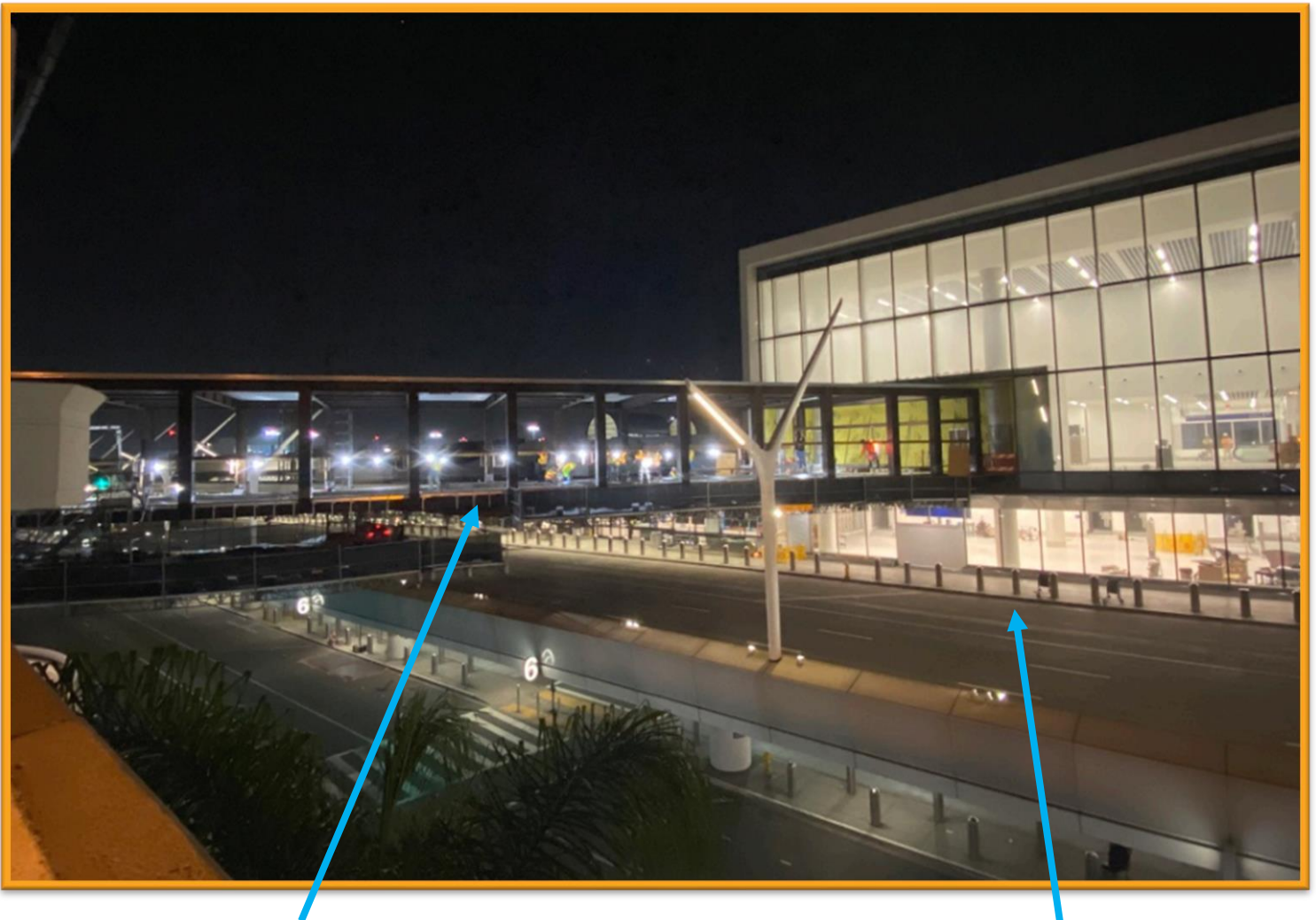
APM Pedestrian Bridge: Concrete Placement