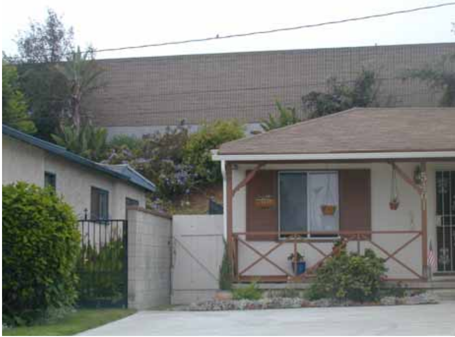
Photo #3: Along Coolidge Avenue facing southeast. View is of the I-405 behind potentially affected properties and sound wall, approximately 15-20' in height.