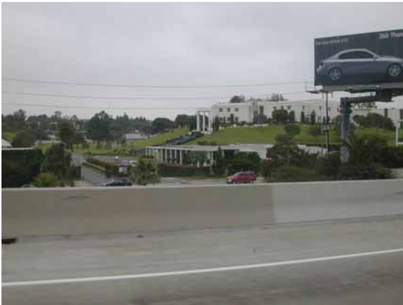
Photo #11: On I-405 northbound facing east. The view is of the Hillside Memorial Park & Mortuary waterfall and Jolson Memorial. The advertising billboard to the right of the photo would be at the approximate height of the proposed Expressway under Alternative 3 and closer to the foreground. Views would be slightly obstructed upon implementation of LAX Expressway.