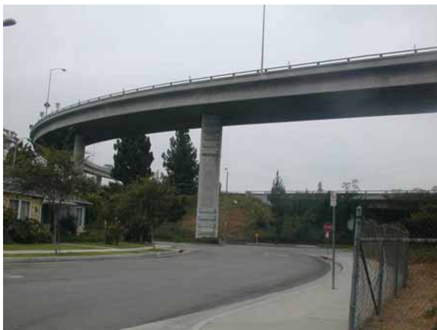
Photo #7: At Culver Park Place and Culver Park Drive leading to Slauson Avenue facing south. The view is of the Jefferson Boulevard connecting ramp to the I-405 northbound. Site of terminus of proposed LAX Expressway Alternative 3.