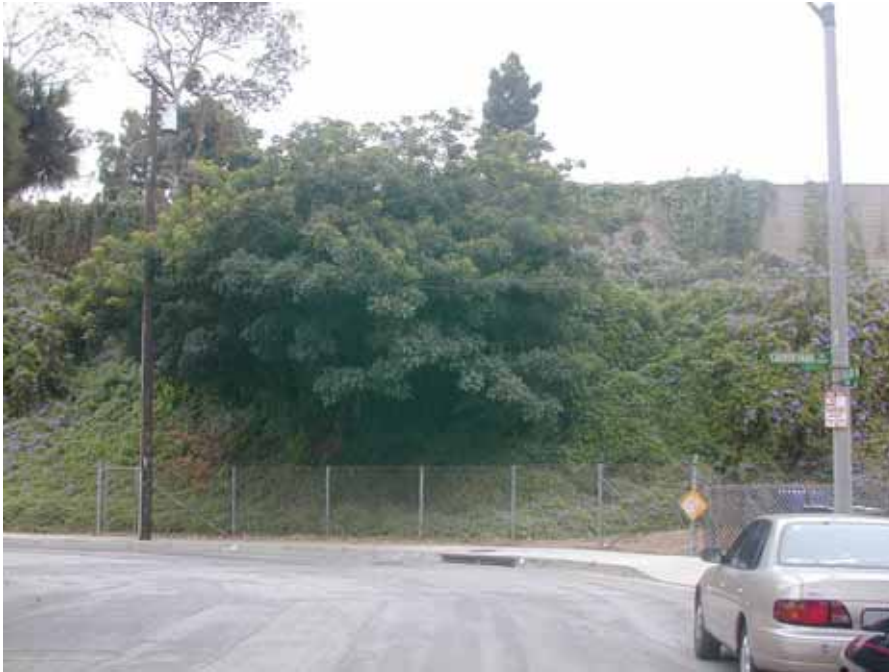
Photo #4: At the corner of Diller Avenue and Culver Park Place facing southwest. The view is of the I-405 up slope approximately 35-40' with 15-20' soundwall.