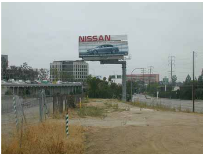
Photo #8: On Centinela Avenue across from the Hillside Memorial Park & Mortuary facing north. The view is of the elevated portion of the I-405, the flood control channel to the left and the signage for the park at the right.