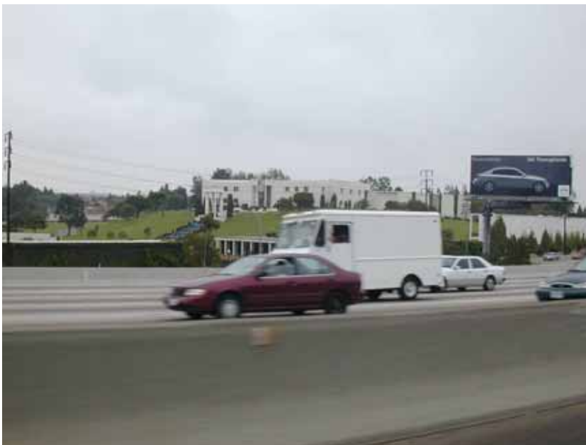
Photo #12: On I-405 southbound facing east. The view is of the Hillside Memorial Park & Mortuary waterfall and Jolson Memorial. The advertising billboard to the right of the photo would be at the approximate height of the proposed Expressway under Alternative 3 and closer to the foreground. Views would be partially obstructed upon implementation of Alternative 3.