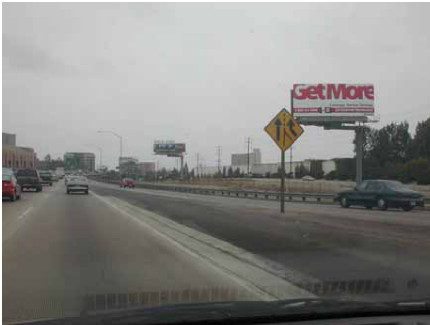
Photo #10: On I-405 northbound at the Howard Hughes Parkway on-ramp. First view of the Hillside Memorial Park & Mortuary signage in the far background and buildings in the middle ground.