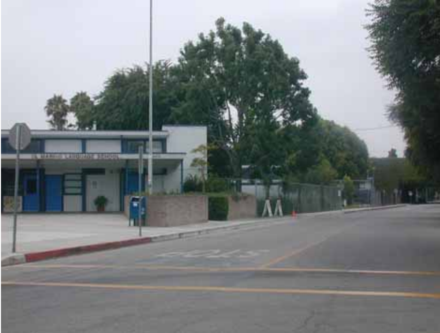
Photo #1: At the corner of Port Road and Purdue Avenue facing southwest. El Marino Language School is in the foreground and the I-405 overpass is in background.