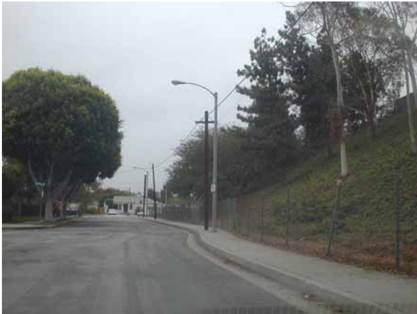
Photo #6: At Patom Drive on Culver Park Place facing southwest. The view is of the I-405 to the right up slope (1:2) and residences on the left.