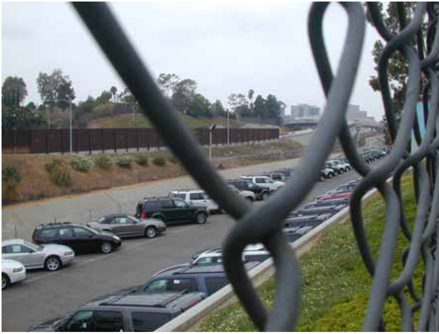
Photo #13: At the northwest property boundary of the St. Jerome School on Thornburn Street facing northwest. The view is of the commercial strip (auto business), flood control channel, and La Tijera Boulevard on-ramp to the I-405.