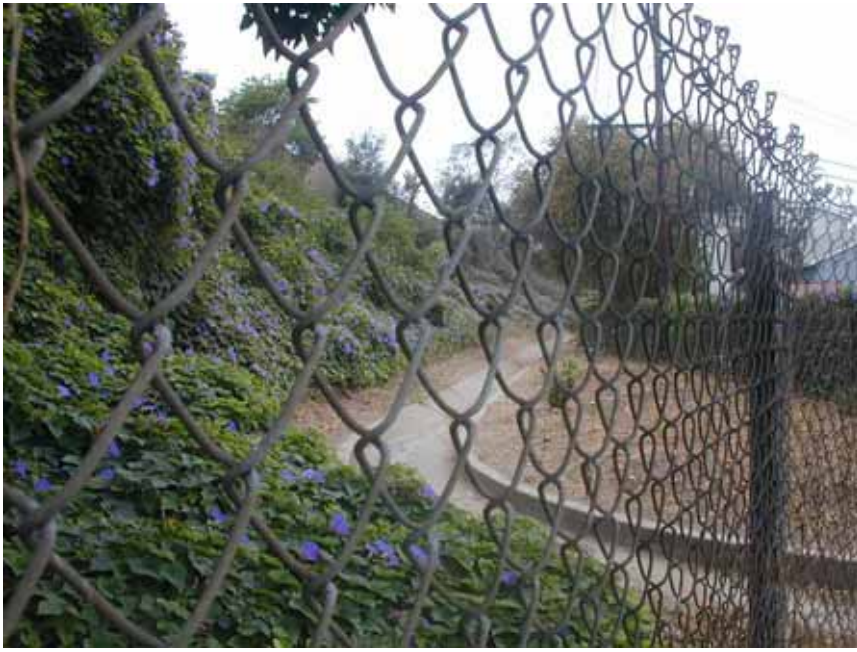
Photo #5: At the corner of Diller Avenue and Culver Park Place facing northwest. The view is of the storm drain behind homes along Coolidge Avenue downslope from the I-405.