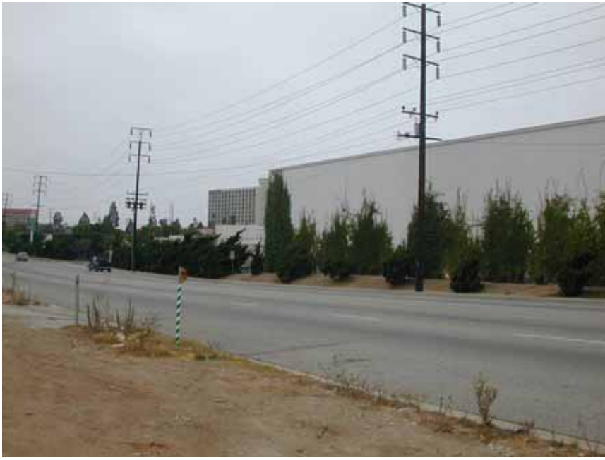
Photo #9: Along Centinela Avenue across from the Hillside Memorial Park & Mortuary facing northeast. The view is of structures associated with the park.