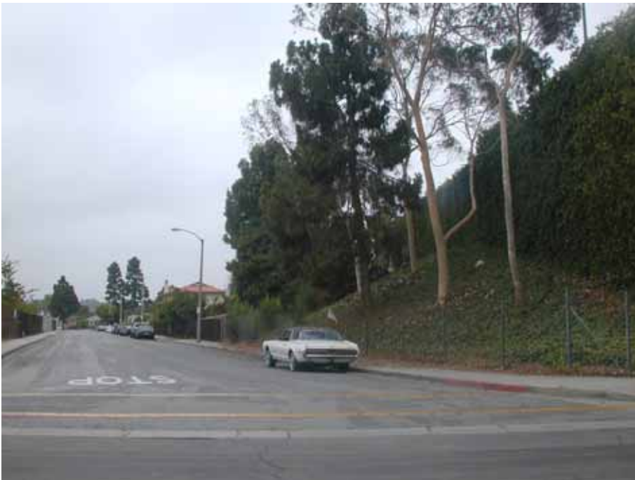
Photo #2: At corner of Port Road and Coolidge Avenue facing southeast. The I-405 overpass is to the right of the photo and the school is to the left. Potentially affected parcels in the background down Coolidge Street are on the right hand side.